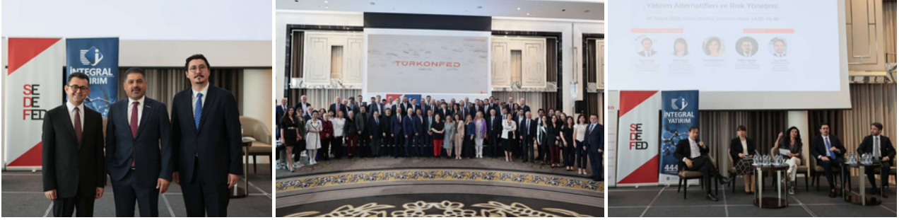
30.05.2023 - Economy & Finance Meetings - İSTANBUL

Economy & Finance Meetings: Investment Alternatives and Risk Management Event Economy & Finance Meetings: Investment Alternatives and Risk Management event, hosted by the Federation of Sectoral Associations (SEDEFED), with the cooperation and contributions of the Turkish Business Confederation (TÜRKONFED), Integral Investment, 30 May 2023 It was held at Hilton Istanbul Bomonti Hotel.