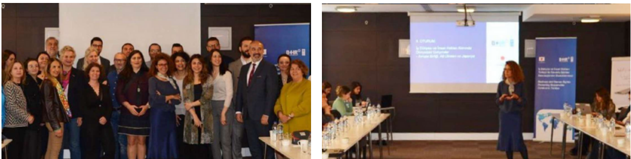
15.05.2023- BHR Trainig - İSTANBUL

Human Rights Due Diligence Training was held hosted by SEDEFED. It was created to support the Human Rights Due Diligence training hosted by the Federation of Sectoral Associations (SEDEFED) within the scope of the "Business and Human Rights Project" carried out in partnership with the United Nations Development Program (UNDP) and the Government of Japan and in the implementing partnership of the Turkish Business Confederation (TÜRKONFED). The project was developed with global partnership. The scope of the project aims to support companies to respect human rights in their global supply chains and to ensure more widespread use of the UN Business and Human Rights Guiding Principles, increased awareness and institutional capacity development for a fair recovery. With the Awareness Raising Training, a one-day training was provided to increase the level of knowledge and awareness of companies in the field of business world and human rights, and to identify areas of need in this field.