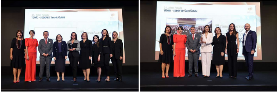
18.10.2023 - Golden Compass Awards - İSTANBUL

In order to promote and encourage successful public relations, the "Golden Compass Public Relations Awards" have been presented by the Turkish Public Relations Association since 1999. We have been presenting awards in association status in the 'SEDEFED Special Award' category in cooperation with TÜHİD for 3 years.