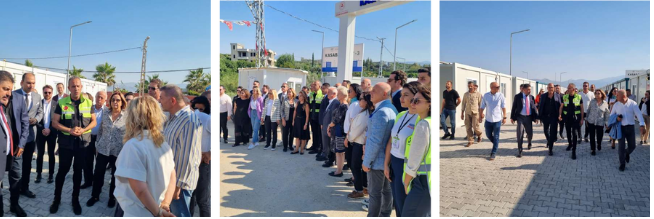
05.11.2023 - KASABA Project - Samandağ/HATAY

In addition to just meeting the shelter needs of the region, it will offer advantages such as priority support, commission discounts and advertising support to SMEs and tradesmen operating in the earthquake zone, in cooperation with Hepsiburada, in terms of developing economic activities and establishing business areas.