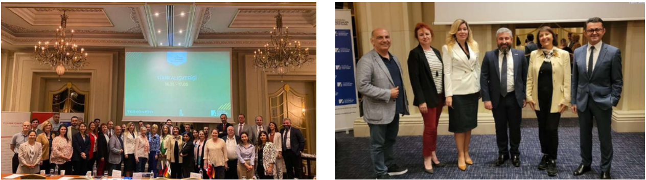
15.06.2023 - Green Transition Event for SMEs - İSTANBUL

Green Transition Event for SMEs, hosted by SEDEFED, in cooperation with TÜRKONFED and KAS Turkey, under the theme of Green Transition Project for SMEs - My Companion, which was implemented to raise the awareness of business people in Anatolia about green transformation; It held the second event of its 3rd term in Istanbul on June 15, 2023.