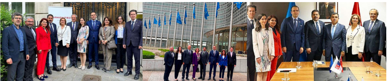
25/28.06.2023 - Brussel Visits

Brussels Visits held together with TÜRKONFED have been completed. TÜRKONFED-SEDEFED Delegation held a series of meetings with official representatives of the Republic of Turkey, senior officials of the EU Commission and managers of organizations representing the business world, including the European SME Association. In Turkey-EU relations, the integration process, updating the Customs Union, energy, trade, EU funds, green and digital transformation, visa issue and refugee issues were included.